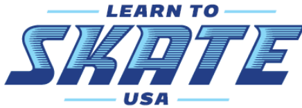
ILLUSTRATION OF THE PROGRESSION THROUGH THE LEVELS OF U.S FIGURE SKATING

Singles athletes begin with the Learn to Skate USA program, then progress to the "introductory levels," and finally choose whether to follow the test track or Well Balanced program category. Athletes may choose to move between test track and Well Balanced program at any point.